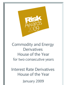
A selection of awards